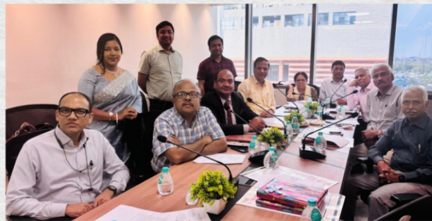
E. C. Meeting 29th March, 2025 Kolkata