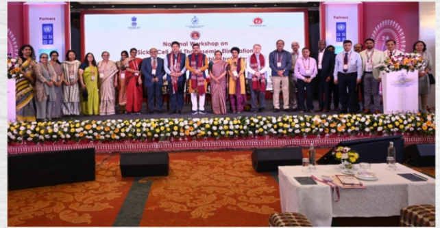
National workshop on SCD and Thalassemia Elimination 11th & 12th March, 2025 Bhubaneswar