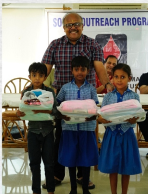
Social Activity Sundarban 28th March, 2025