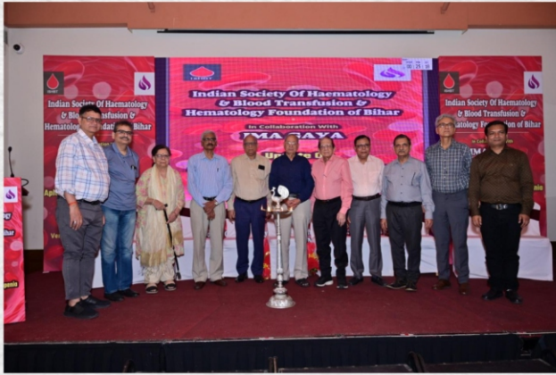
Update on Aplastic Anaemia and Pancytopenia 23rd March, 2025 Bodh Gaya